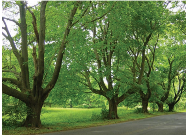
Booth Easement, Southold, conserved August 2006

The New York State Conservation Tax Credit—the first of its kind in the nation—provides an annual rebate of 25% of property taxes paid on perpetually protected land, capped at $5,000 per year. This rebate is available to all owners of qualified easement-restricted land (regardless of when the easement was donated) and is effective beginning with 2006 taxes. The Land Trust Alliance New York Program worked with the State Department of Taxation and Finance to finalize the implementation process.