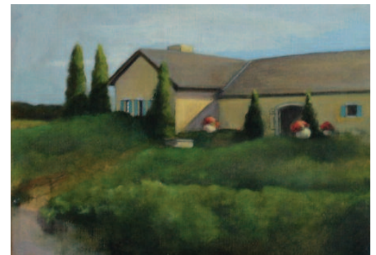
Aubrey Grainger Wölffer Estates