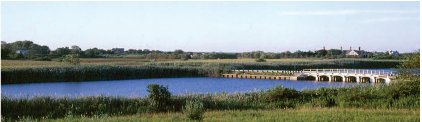
The White's Golf Lot property is located to the left of Sagg Bridge.