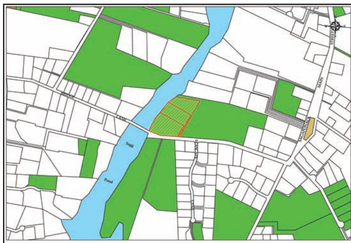
Map of area surrounding White farmland parcel. The red boundary lines indicate the 10 acres that are the subject of this article. The parcels in green represent protected land in Sagaponack.

And this is where the community came in. The Peconic Land Trust had been working with the family and the Town when an impasse on the price occurred. At this