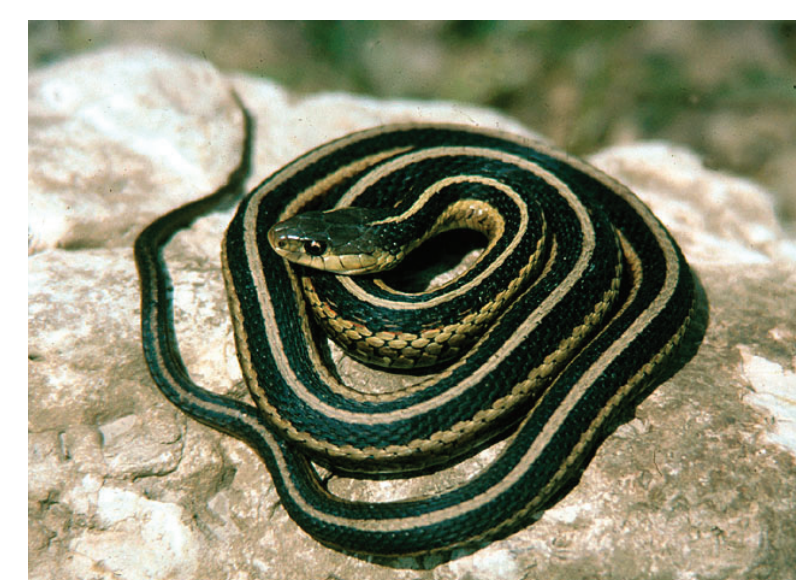
Eastern Garter Snake